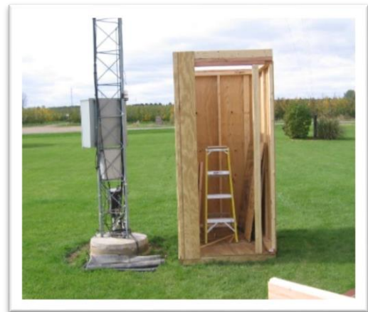
New Construction in Early November of the upcoming MASRA Repeater location. "Shack" is currently completed and equipment install is beginning.

, N8GS tower located near 10 Mile & PeachTree North of Grand Rapids. Coverage will definitely increase with northern borders likely reaching North to Hart, and East to Portage, possibly Lansing, and south to Plainwell.