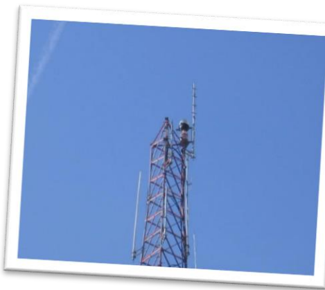
Old W8USA repeater tower located just North of the Grand Rapids Downtown. Move is expected in Mid January

As far as we know at this time, this will be the only C4FM/FM repeater in the greater Grand Rapids area. We are looking to have this repeater online in its new location in the latter half of January.